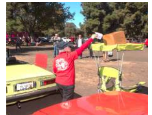
Voting early, and often at the Best of France & Italy

Mark your calendars, invite family and friends, and plan to make a day of it.