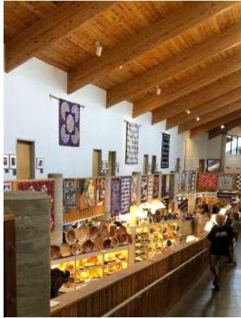
Clockwise from top left: the Barretts' 2nd place Gimmick Rally trophy; Pre-Tour days were too rainy to see the garden at the summit; Ron in his element; Paul puts Convention swag to work; the cross-country fleet; Southern Highland Craft Guild Folk Art Museum was amazing.