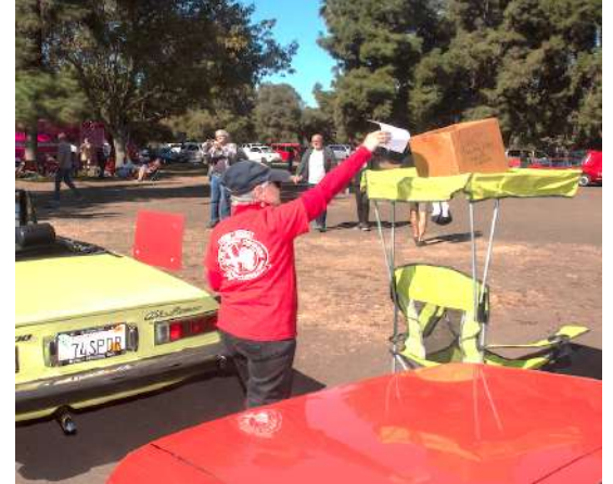
Voting early, and often at the Best of France & Italy

It is time to celebrate the season at our favorite fall fun-for-all: The Best of France & Italy Car Show at Woodley Park in Van Nuys this Sunday, November 5th!