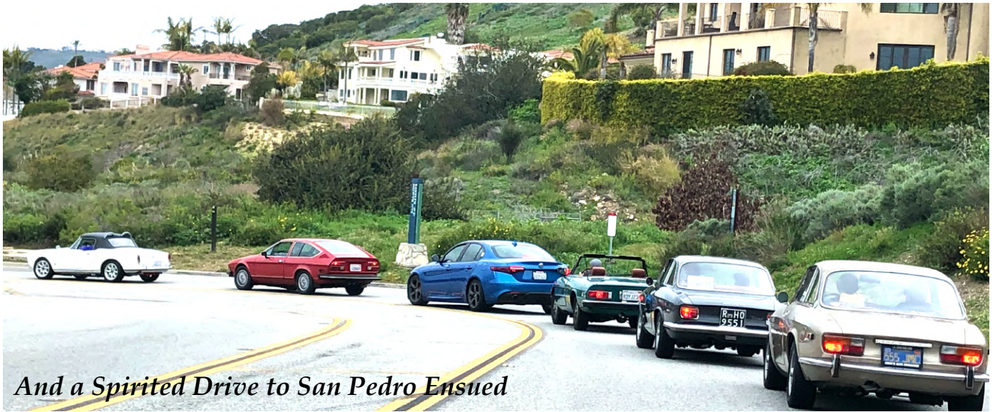
And a Spirited Drive to San Pedro Ensued