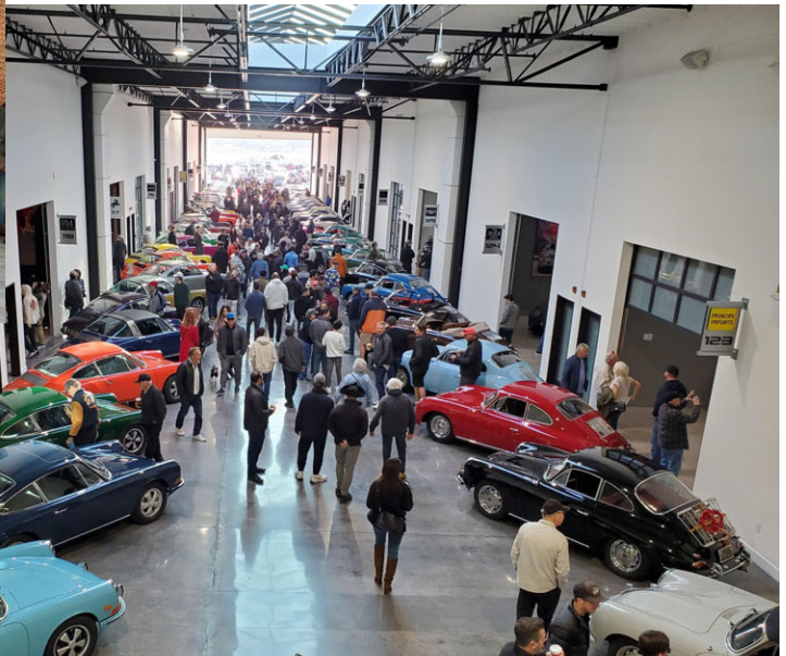
From top: Santiago Canyon; Alfa Row; inside Suite 117 and Finish Line Auto Club viewed from the mezzanine.