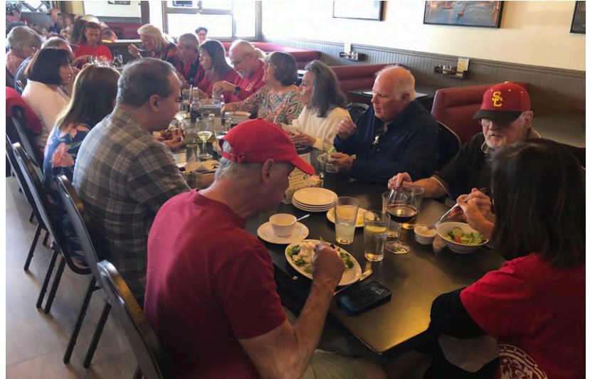
Like everything else this day, we exceeded our reservation headcount by four diners, and our host graciously accommodated us.