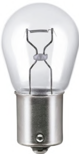
Bayonet Base bulb (left) and Wedge Base bulb (right).

variety of colors. Some can even change colors on demand. They also offer the designer more flexibility in lighting allowing more even