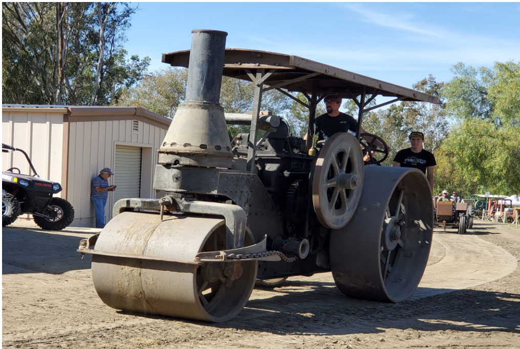
Below the hottest steam roller we've ever seen rocks the midday parade.