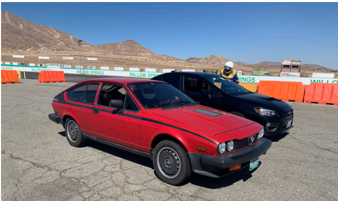
The Alfa Experience at Big Willow - on page 3