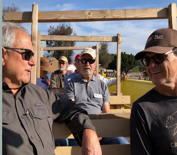
Tractor Tour at AGSEM - on page 6

The Newsletter of the Alfa Romeo Owners of Southern California