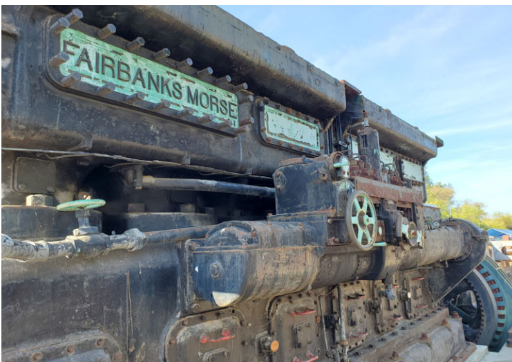
This massive 3-cylinder diesel motor once powered the City of Avalon.