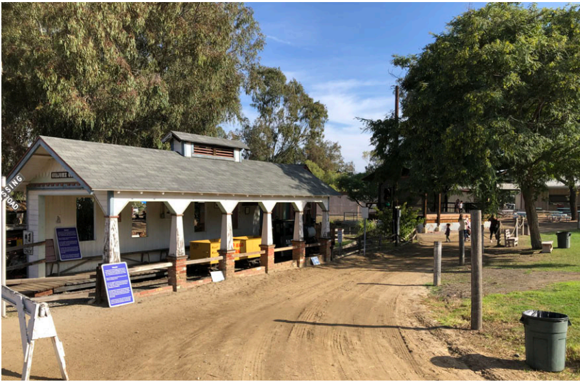
Left, the Guajome mini-railroad station welcomes riders