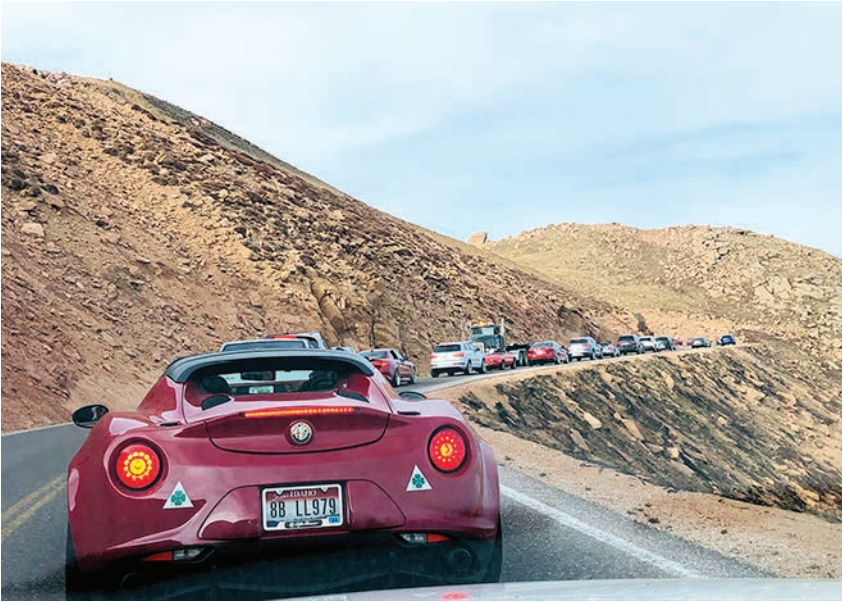
Pikes Peak Alfa Brigade waits at the side for big rig to pass downhill.