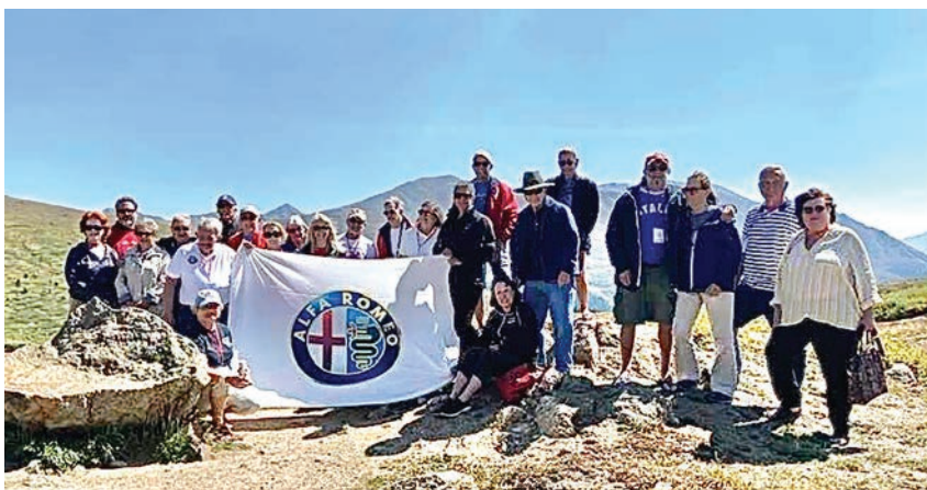
West Tour Group at Independence Pass.