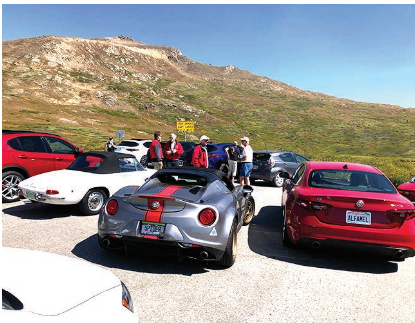
Assortment of Alfas at Independence Pass