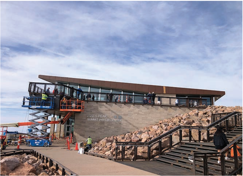
Visitors center at Pikes Peak summit is dramatic too!