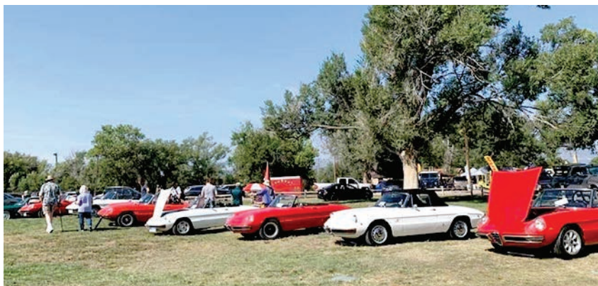
Spider row at the Colorado Convention Concorso.