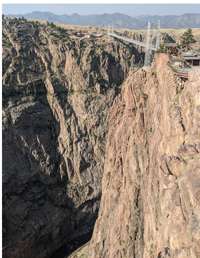
Royal Gorge suspension bridge is a mile-high wonder.