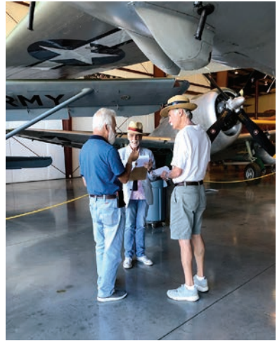
Our Judges in action.