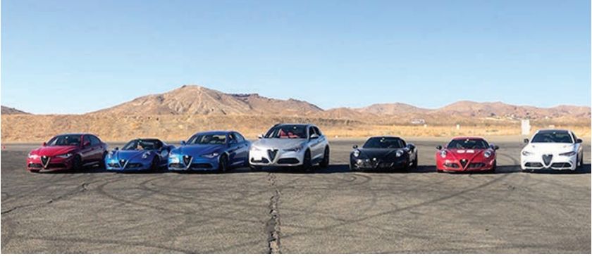
Mighty Alfa Lineup! (Left)