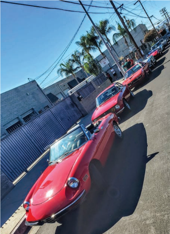
Steve Edelman shot this surreal view of all the various red cars lining the curb outside of Santo's shop.