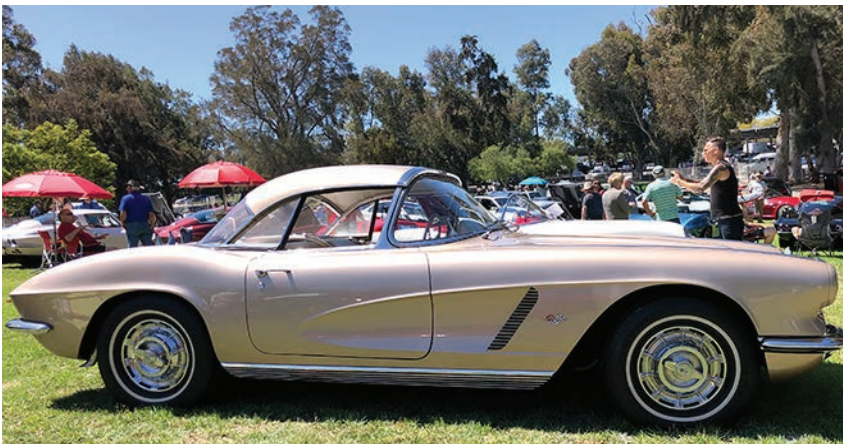
Can a Corvette look more elegant than this?

The Alfa Romeo Owners of Southern California celebrated its first, post-Covid concors on August 1st when it participated in the Huntington Beach Concors. Like many things, the concors was cancelled last year and postponed from its normal June date in 2021. It is a much-loved event that has become a staple of the Orange County car scene since 1986, so AROSC was pleased to be a part of its return. The concors is a non-profit event that benefits the Children's Resource Center at the Huntington Beach Library. (Story continues on Page 41)