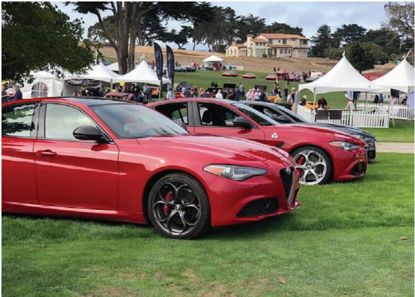
21st Century Alfas grace the Concorso Italiano greens.