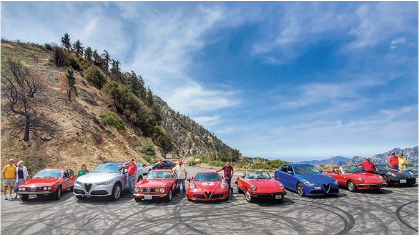
Quintessential group portrait at Islip Saddle, the favorite burnout turnout on Angeles Crest Highway.

The road was good, very few rocks to avoid, and no construction areas. The pace was close to speed limit (a chopper was seen above and it may have been CHP), but maybe we didn't really slow to advised speeds at curves because they can be so much fun.