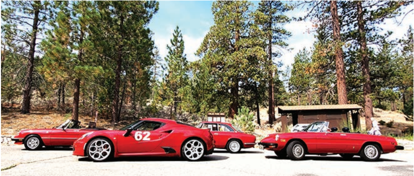
Racy in red, a span of years and styles of our favorite sports cars; the sporting parade through the pines continues above and below on the way to Wrightwood.