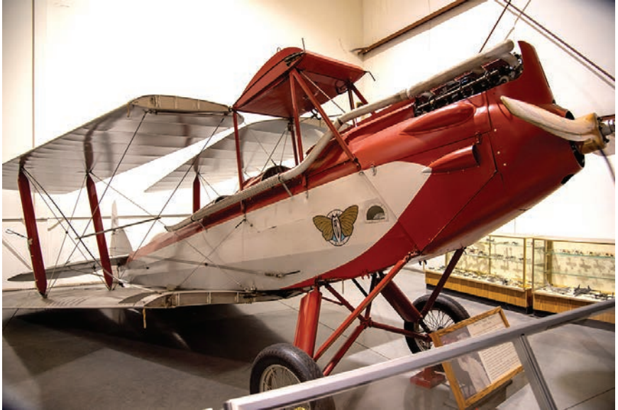
A beautiful Gypsy Moth in the classics hangar, above. Below, SoCal-made Lockheed P38 Lightning equipped for reconnaissance duty.