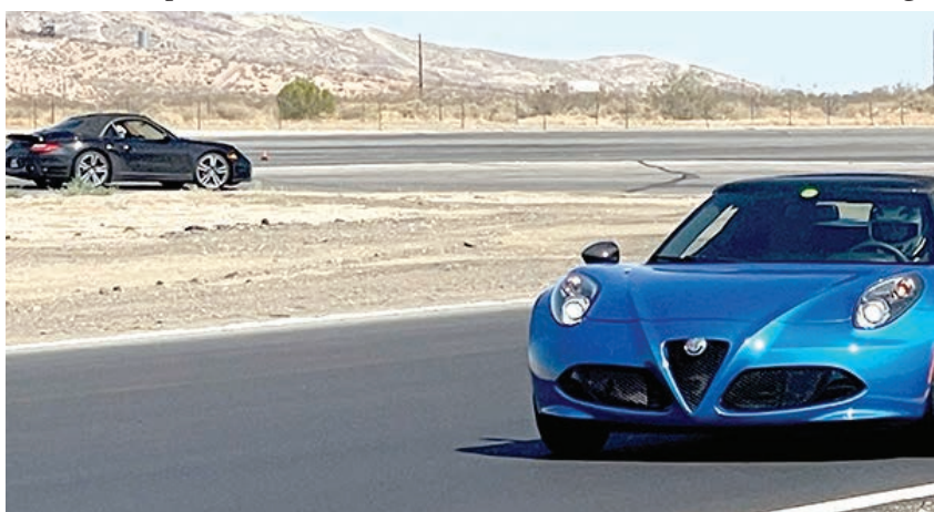
Brilliant blue 4C etcetera ..... more info??

Competition Chair, 2022 AROC National Convention, San Diego