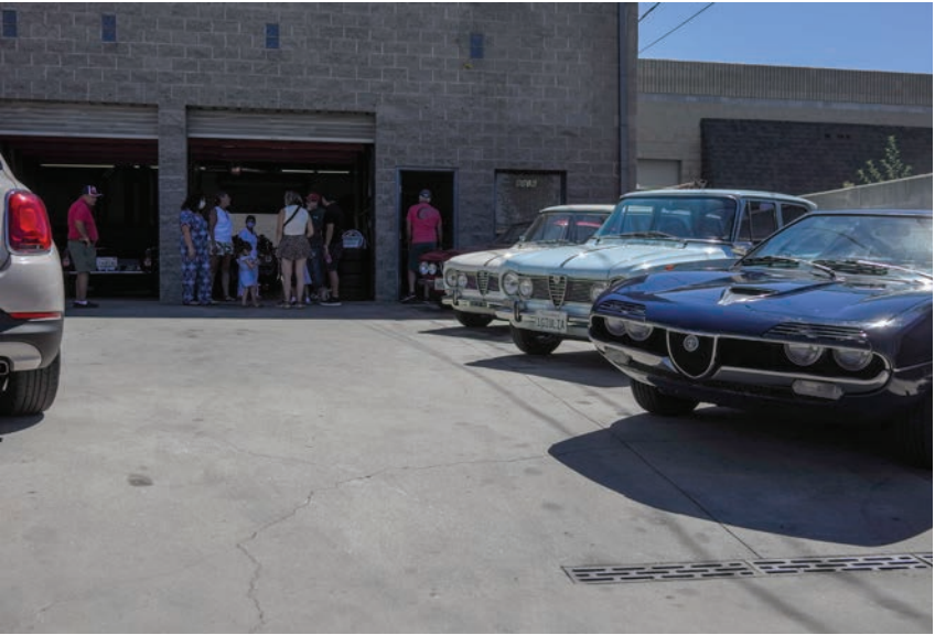
Above, Giulias and a Montreal decorate the front driveway. Below, so great to see the youth element showing some interest!