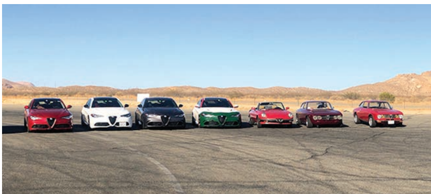
Mighty Alfa Lineup! (Right)

days. I would like to post any good Alfa news on the Facebook page for Alfa Romeo Owners Club USA. Sort of a counter to the frequent inquiries that read: “So how reliable are the new Alfas?”