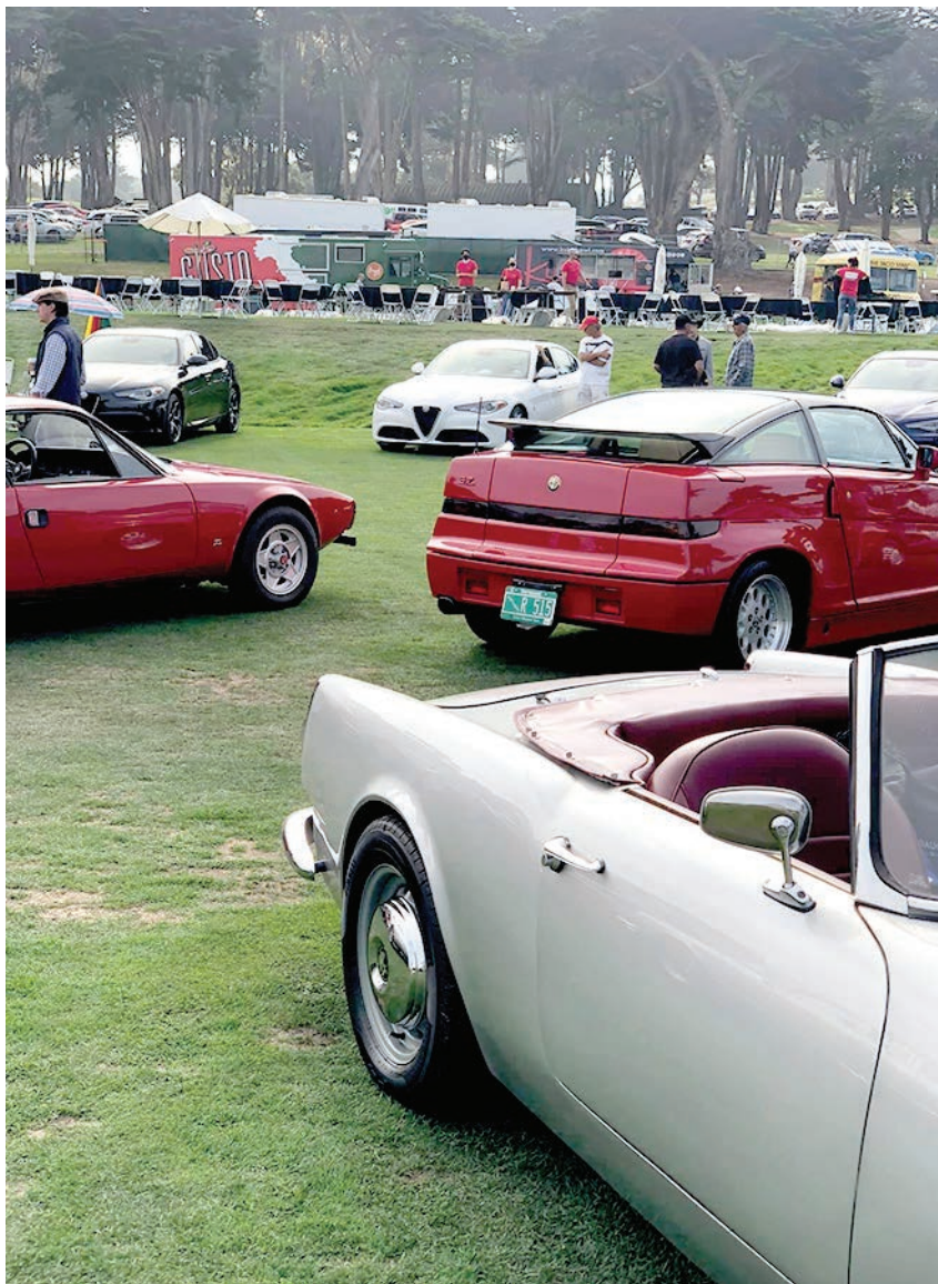
The wonderful mix of Alfa styles in the early morning at Concorso Italiano. No credit yet.