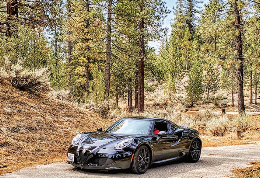
Nice portrait of black 4C running through the forest.