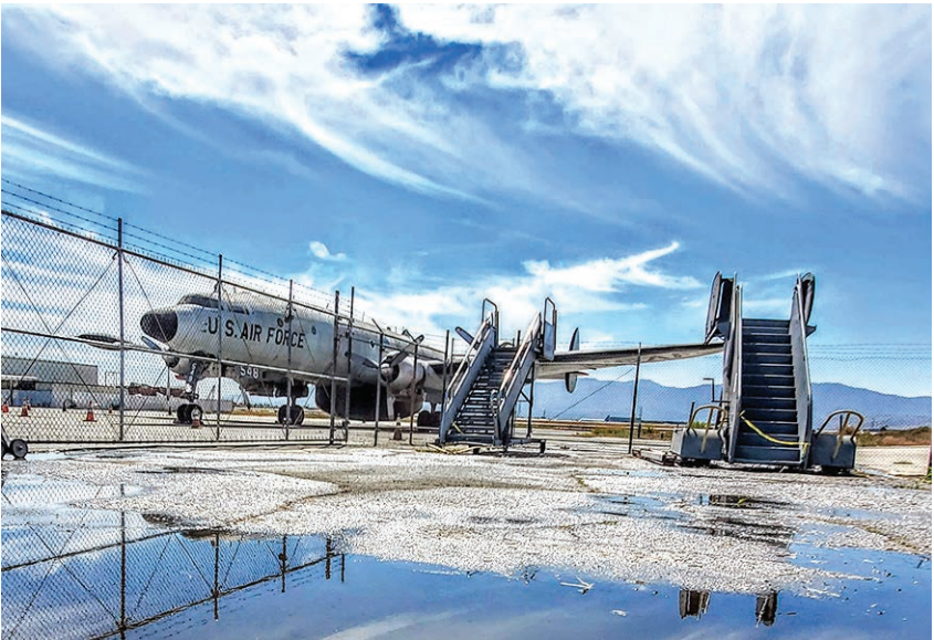
USAF veteran prop jet is ready to fly anywhere from Chino.