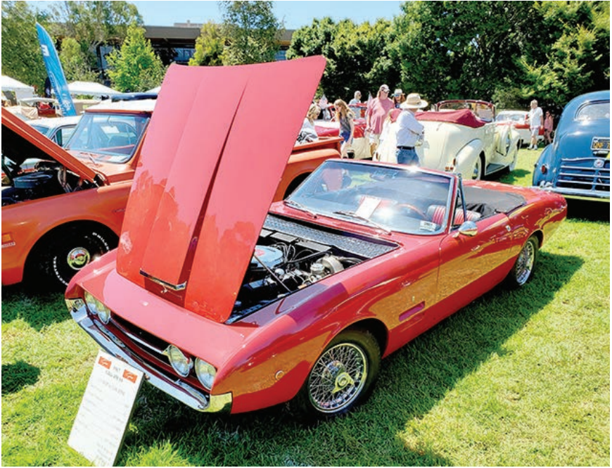
Above, this 1967 Ghia SS is rare and gorgeous. Below, this is as much of the Closed Car row as we could fit in! Call it Rhapsody in (mostly) Red.