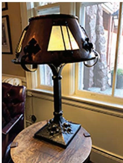
Redstone Lobby decor detail.