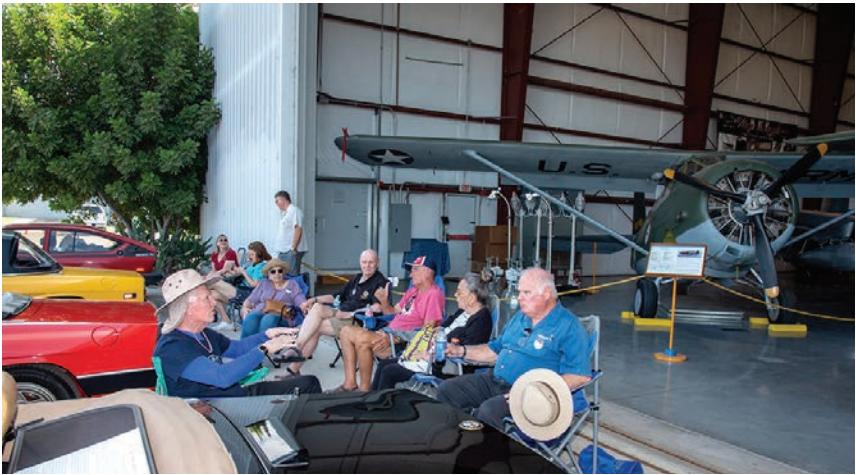
It was great to have some shade and the view of classic aircraft.