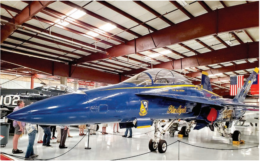
Even at its age, this Blue Angels jet is awesome to behold.