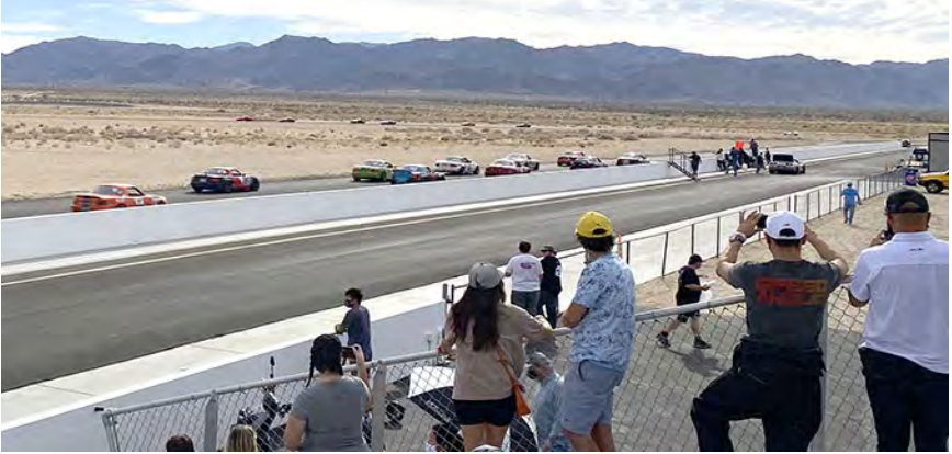
Super Spec standing start.

made some upgrades to the power and aero so it could run competitively with the Super Spec group. This group shared the race session with an eight-car Corvette Challenge (plus one Panoz), both using a standing start to begin the five-lap race for points. When the five laps are done, they quickly reset with an inverted grid (fastest in back, another points race) for the remainder of the 35 minutes, which is super fun to watch. There were almost 30 Miatas running at this meeting.