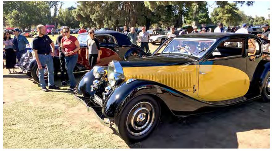
Your Correspondent was just about to take a photo of the black and red Bugatti when he had to step aside to let its black and yellow twin park alonside! We are not up on our Bugatti Types so we can't tell you what they are, other than gorgeous.