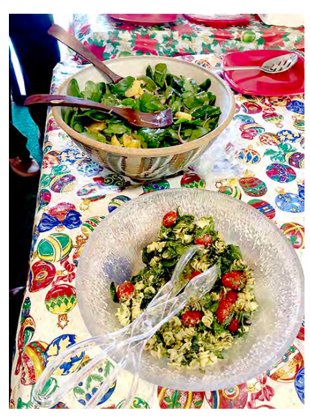
Left, a holiday bounty of potatoes, pulled pork, chile relleno casserole, quiches and other seasonal wonders. Right, sumptuous salads!