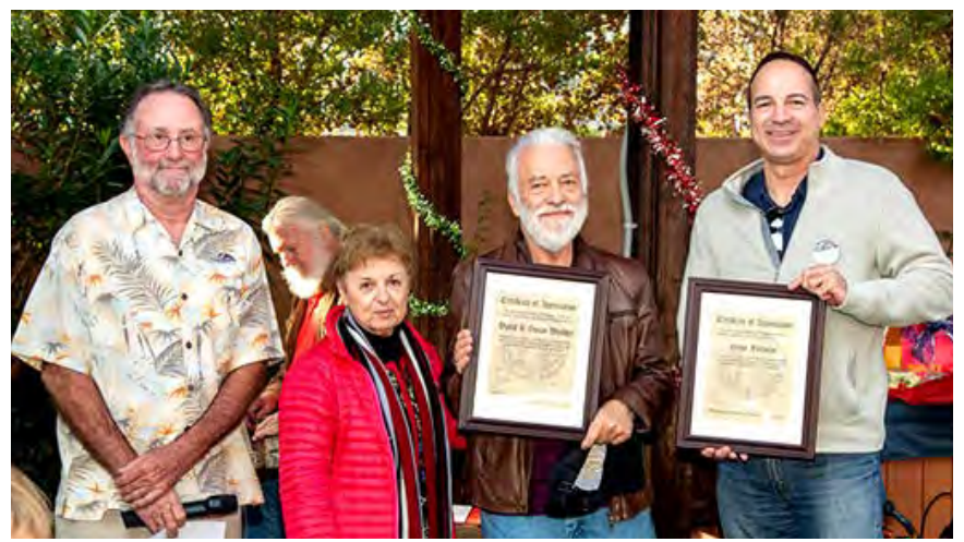
Above: Holiday Party 2019 Story and Photos, Pages 12-16 Below, Laguna Seca Race Weekend Report, Pages 24-28