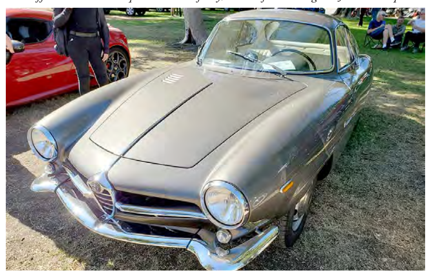
Giulietta SS was clearly the Belle of the Ball.