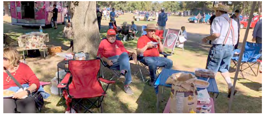
The Official AROSC Banquet Hall. Not fancy, but the food's sure good.