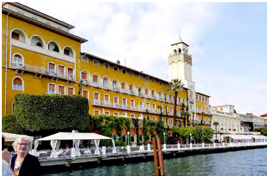
The Grand Hotel as seen from the river ferry.