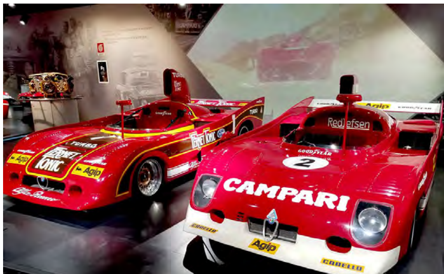
Winning T33s at the Museo Storico Alfa Romeo in Arese..