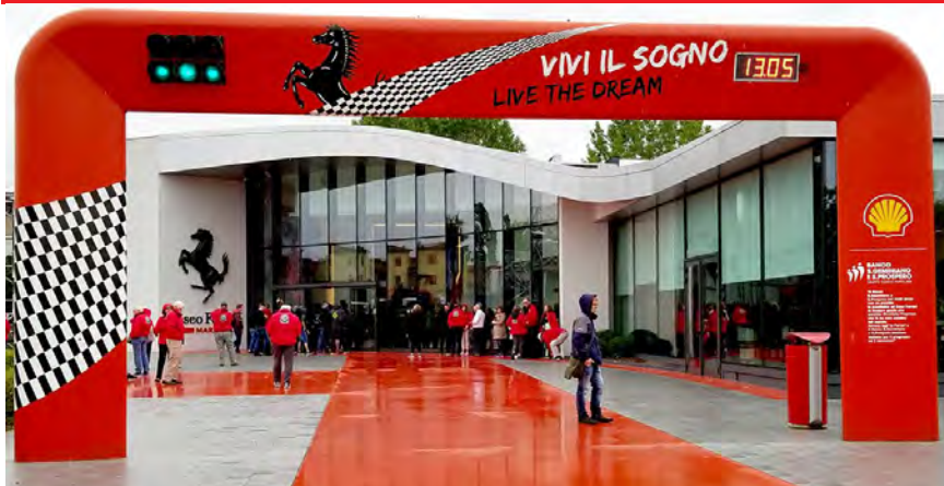
Contrasting approaches to museum signage: Above, entrance to the Ferrari Museum. Below is the Deco-style sculptural sign in front of the Mille Miglia Museum.