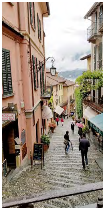
Above, rainy but pretty Bellagio. Left, in the Nuvolari Museum.