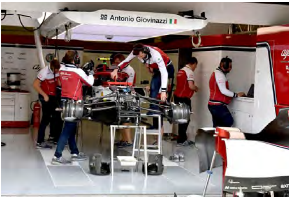
Enough with McLarens – Time for some Alfa stuff! Clockwise from top left, the Alfa Team flanking their new mascot; vintage 1982 Alfa F1 182; Alfa garage with a car being worked on.