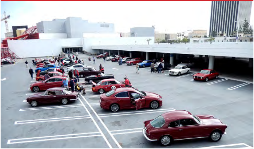
Concorso #1 from above.

AROSC’s Concorso Season Opener was an incredible event on Sunday, May 5th, where 35 Alfa Romeos and over 60 enthusiasts gathered at the Petersen Automotive Museum for day of four-wheeled bliss. Thirteen diehard Alfisti polished, shined and dusted their Alfa Romeos and a gaggle of judges descended upon those gorgeous machines with clipboards and pens in a flurry of activity that crowned champions of the day (see listing below). Congratulations and thanks to all the Concorso participants.