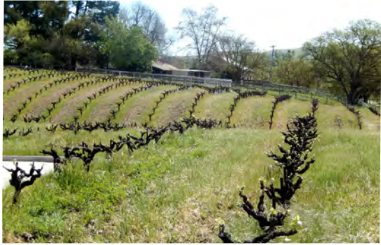
Vines at Bella Luna.