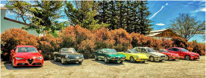
Strong Alfa content on this tour; second stop is at Sarzotti in Templeton.