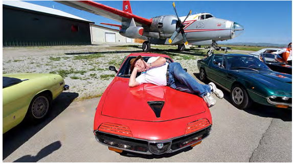
Mr. Brown and Montreal in repose.

In an internal combustion engine (ICE) which uses intermittent combustion as opposed to continuous combustion (gas turbines, jet or rocket engines) it is necessary for the ignition to occur at the correct time in the cycle. If the ignition occurs at the wrong time, then the engine will run poorly or not at all.