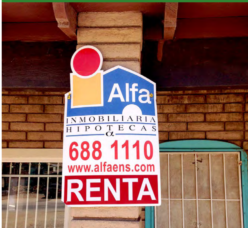
Alfa: It's not just a car anymore, it's a vacation rental too! Sign in La Jolla, Baja.