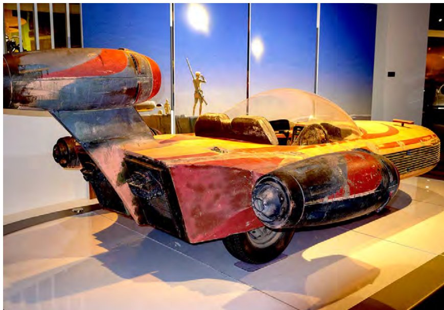
Above, "Star Wars" vehicle still filthy from its life on Tatooine, but the anti-grav isn't working anymore, hence the wheels. Below, no fantasy: Shelby really did autograph the first production Cobra.