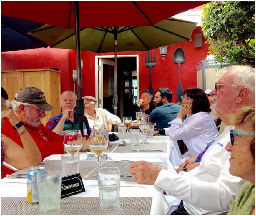
Above, excellent service and a relaxed atmosphere, including wine, were waiting for us at Gianni's. Below, delightful dessert, too!