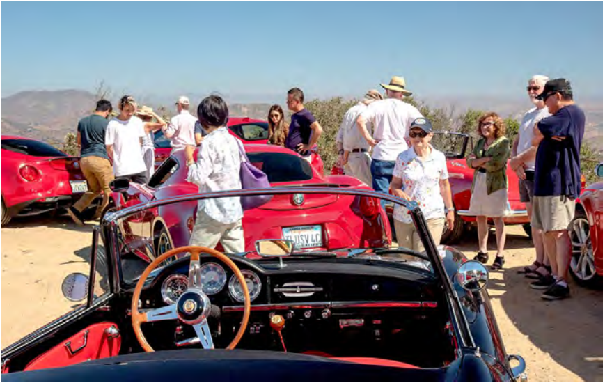
Fabulous turnout at the turnout.