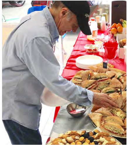
Great Lunch from Priscio's.