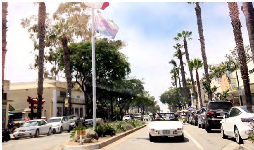
Above, the Rosen Duetto heads into beautiful Carpinteria. Below, Giannfranco's Trattoria was our Day Drive lunch destination, and a great choice it was!