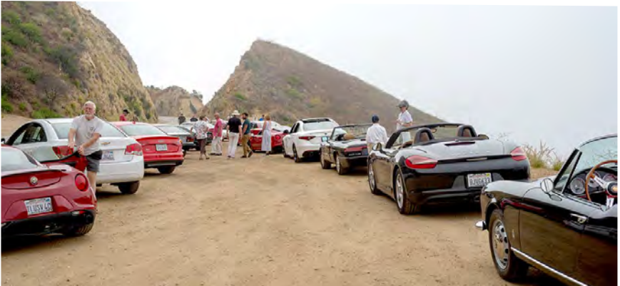
Of course, all the turnouts were not sunny, as we see here ... but that's the Coast!