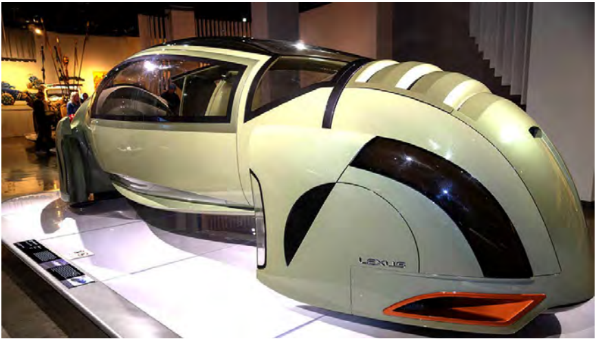
A Lexus-designed electric fantasy-mobile in the Hollywood Dream Machines exhibits.