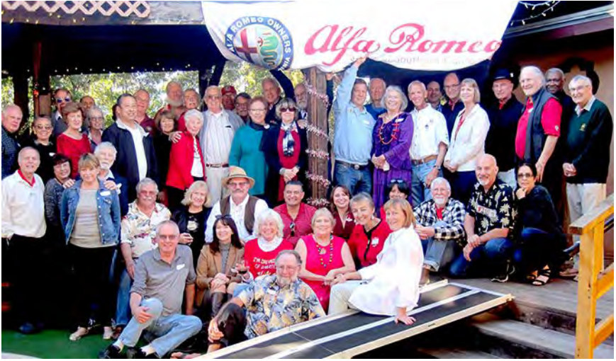
60+ Alfisti enjoyed the 2018 Holiday Party! Story and photos pages 16-20.