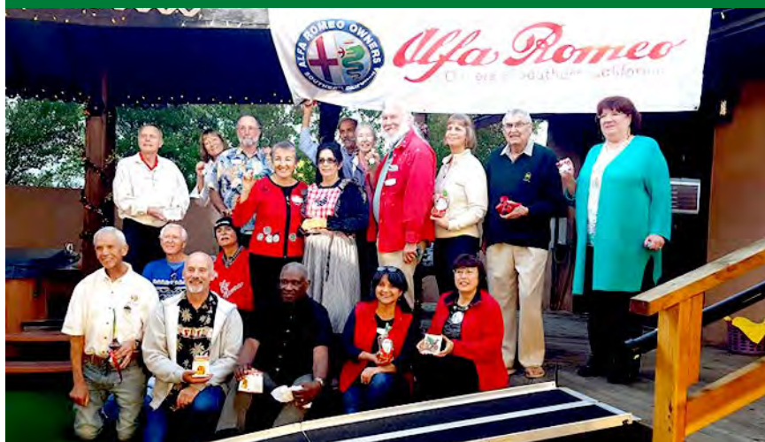
Happy winners of the ever-popular prize drawing.