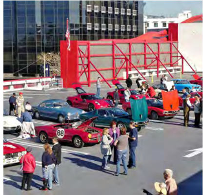
Club Concorso #1 is at the Petersen on May 5th. See info on pages 14-15.

Calendar 4 • Palm Desert Update 21 • New Track Schedule 26 • Classifieds 27