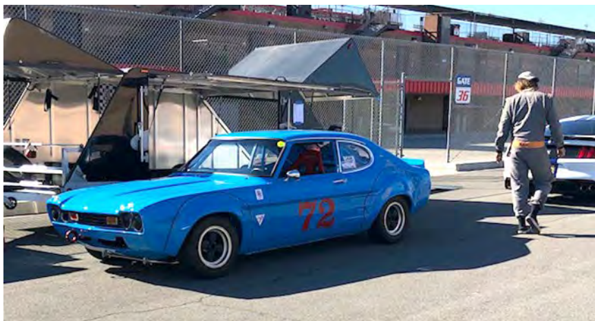
Very cool '73 Capri.