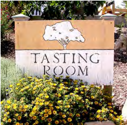
Our Wine Tour is planned for April 5th-7th. Further details are on page 21.