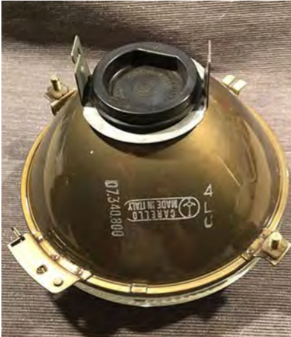
Carello European (Fiat) headlight