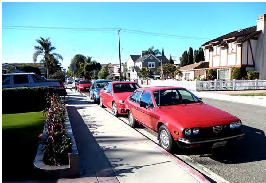
Alfas filled the neighborhood.

The fabulous reviews are once again in: “We had a wonderful time!”; “Thank you for another great event!” What’s not to like about this party? If you missed out in 2018, plan to come this year, same time, same place!