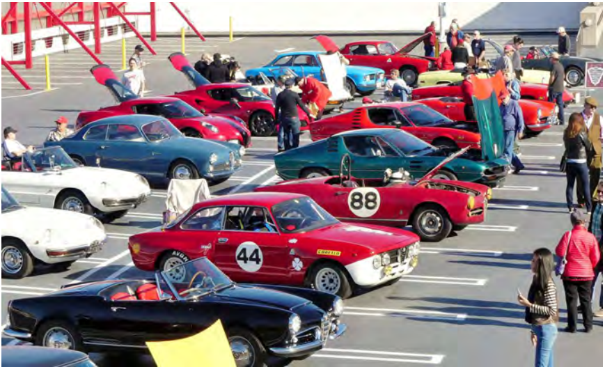
Great turnout for the 2017 Concorso at the Petersen.

Afternoon free time or Vault Tours (must book in advance)