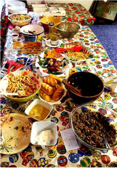
Fanstastic array of veggies on display for just a minute – the latkes are already gone!