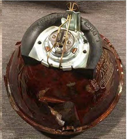
Carello U.S.-market Montreal headlight