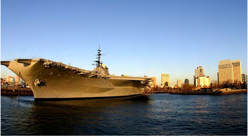
The USS Midway, shown against the backdrop of downtown San Diego.

AROSC's touring season starts early in this year with a jaunt to San Diego, February 8th-10th. Save the date and make your hotel reservations early; this will be a sellout. Here are the preliminary details.