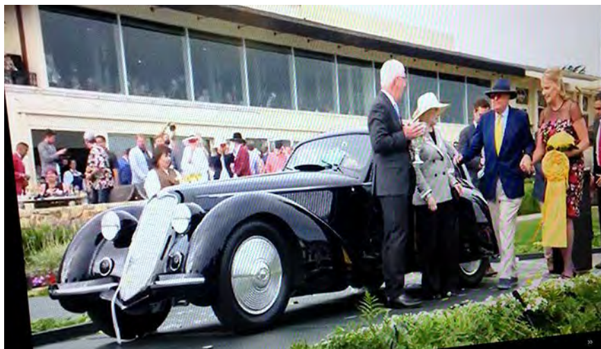
The Sydoricks' 8C 2900B is honored as Best of Show at Pebble Beach.