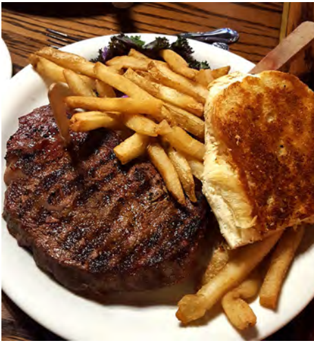
Dinner at Shaw's.