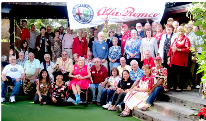
Above, the whole jolly crew crams in for the obligatory-but-always-fun Group Shot.