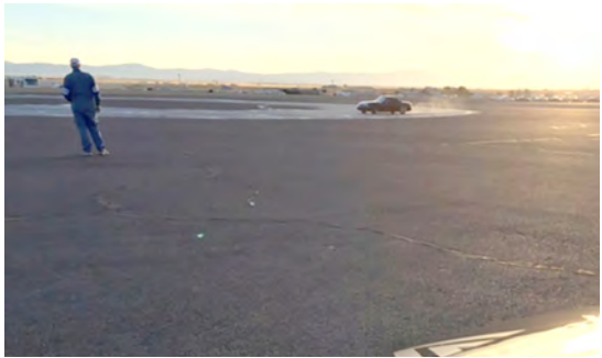
Fun with water in the desert, or the skid pad lesson: keeping the round-side down.

With the great California drought over for the moment, we had full use of a water truck for the skid pad sessions at The Streets, where it was the place to learn weight transfer and contact patch a little better. Would this help for future practice in the rain? On on-ramps? In big open parking lots? Naw, that would never happen, but this will help tons on the road for sure.