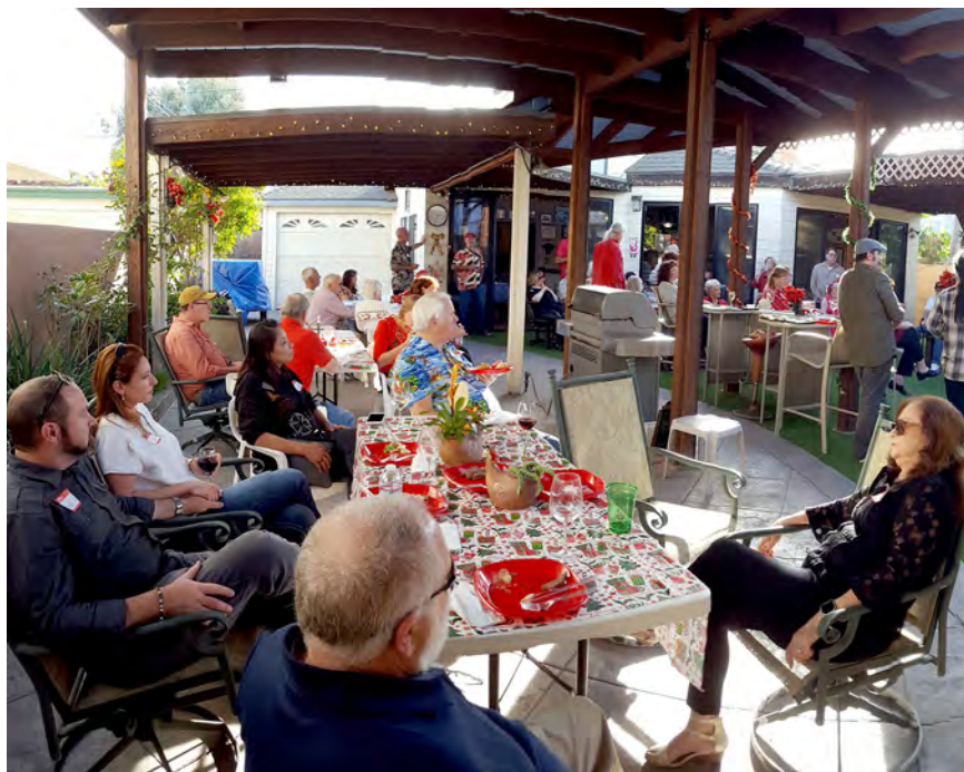
How very SoCal – alfresco in December!