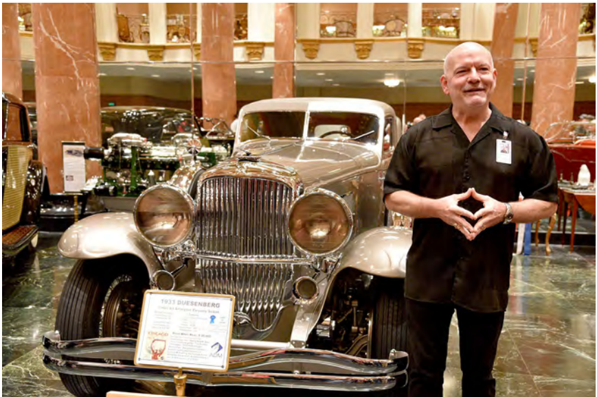
Our guide did an impeccable job of showing us through the collections.