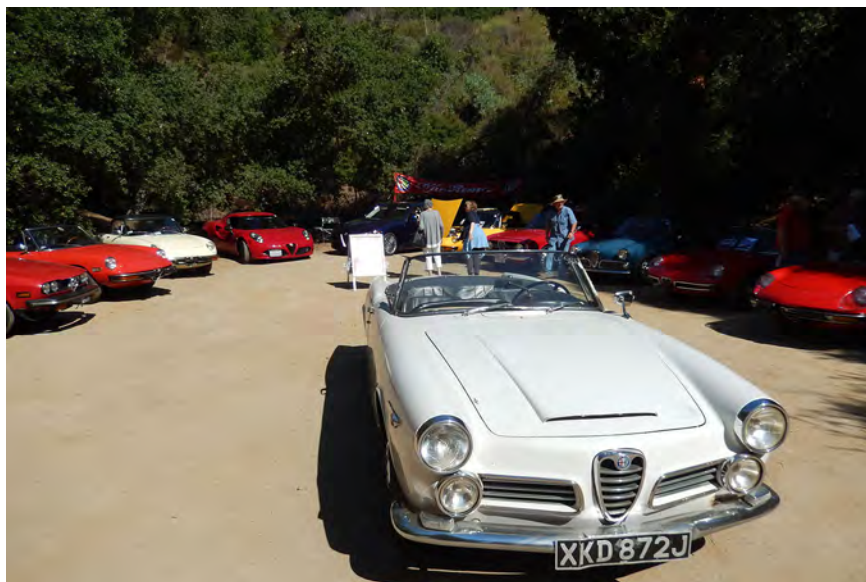
Our turnout overfloweth; there were 25 Alfas here plus three more out in the HE public area.