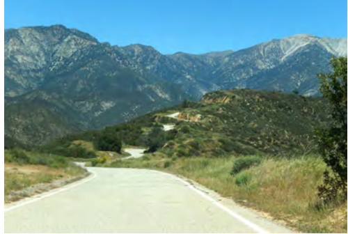
Glendora Ridge Road, one lane across the top of the world with distracting scenery.

Our lunch will be a non-structured drop-in at Mt. Baldy Lodge, as they open at 12:00Noon. The food is outdoorsy fare with beef, turkey, chili and potatoes