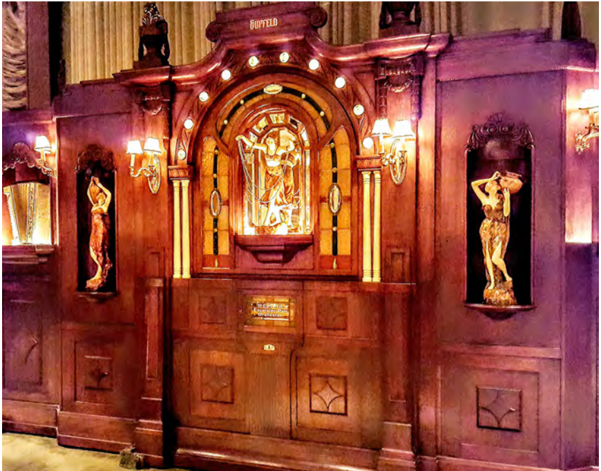
Not a car: The Hupfield Excelsior Pan-Orchestra organ in the Nethercutt Museum. Like an Alfa, what it does is even more amazing than how it looks.