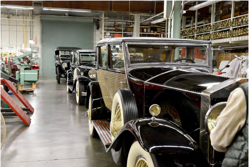
Lineup in the restoration shop puts cars to the right and heavy equipment to the left. Just being allowed inside a shop of world-class quality such as this one is the stuff of a car-addict's dreams. Don't touch anything! David Waelder touched only his camera ...