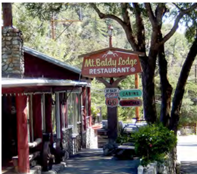
Mt. Baldy Lodge is our lunch destination.