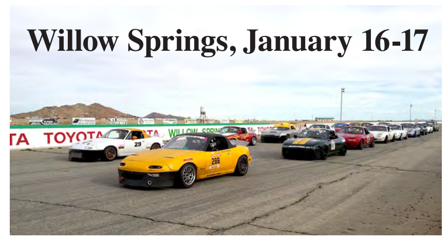
Cars on the starting grid.

The weather gods smiled on AROSC once again for our January trip to Big Willow for another track weekend. We had a good turnout, a good mix of both Alfas and and Miatas, and a number of other makes at the event. The January event has become a recent tradition for all the Alfa owners to shine up their acts and bring them out to play as a group, and it was a great sight seeing so many GTVs in all forms out on the track.