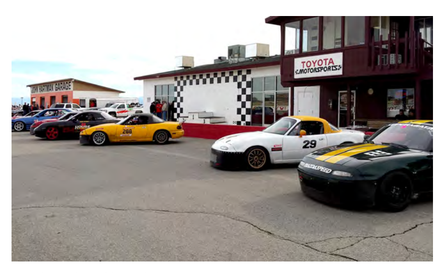
Mazdas in the paddock.