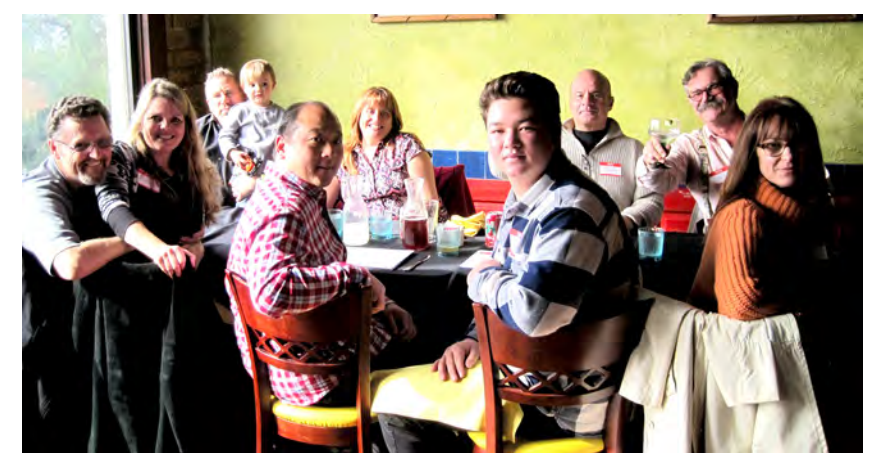
The Table 4 crew looks pretty happy, too.