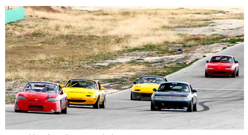
Lots and lots of Mazdas!

short race. The results were interesting, with a bunch of the Super Miatas turning 1:36s to 1:38s, and most of the other cars clustered around 1:41s to 1:43s.