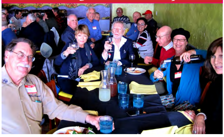
If this looks like fun, it was!

"Great Awards Banquet", was the general comment from the 64 people who came to enjoy the food, the wine, the awards and especially the camaraderie with folks from both the Competition and Social sides of the Club, including 26 track participants.