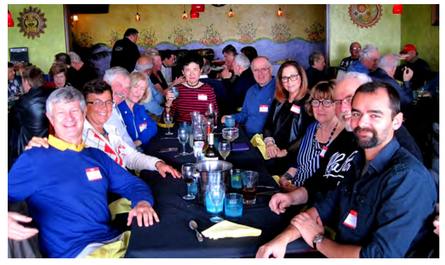
The folks at Table 1, old friends and new, seem to be having a good time