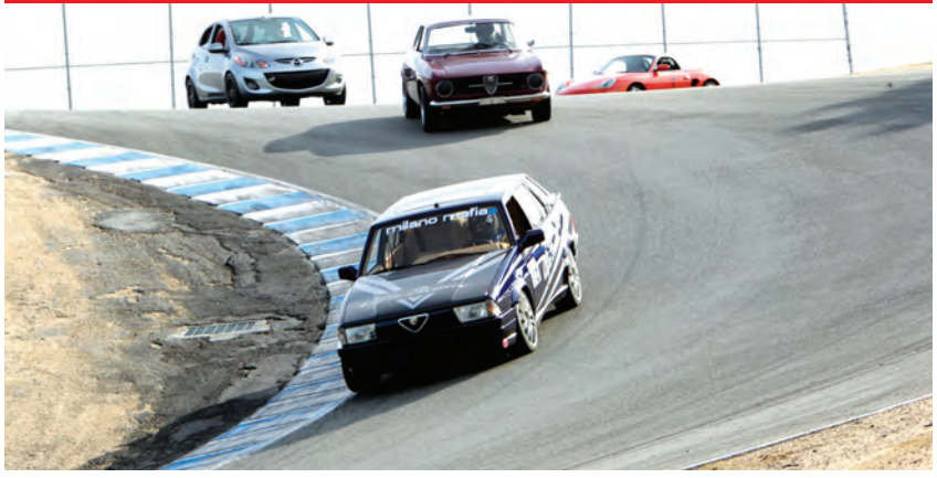
AROSC Time Trials and High Performance Driver's Ed are conducted at tracks all around California, including Buttonwillow Raceway

Alfas encouraged but not required to participate. All marques welcome!