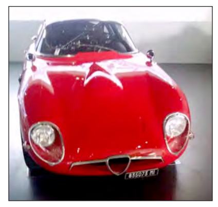
Alfa TZ Autodelta.

AROSC membership has its privileges. If you are not a member or do not RSVP by February 21st, you will not enjoy free parking, coffee and pastries, or the guided tour. You are encouraged to respond early to reserve your spot on the tour and drive your Alfa for reserved free parking.