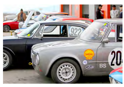
Alfas at rest.