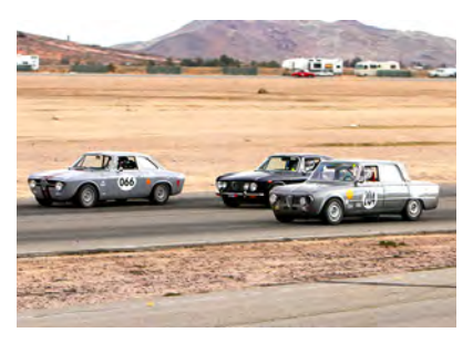
Alfas at speed in Saturday's TT action.

off my personal best time by a second. Everyone else seemed to be turning excellent times too. Must have been that cool, early morning air!